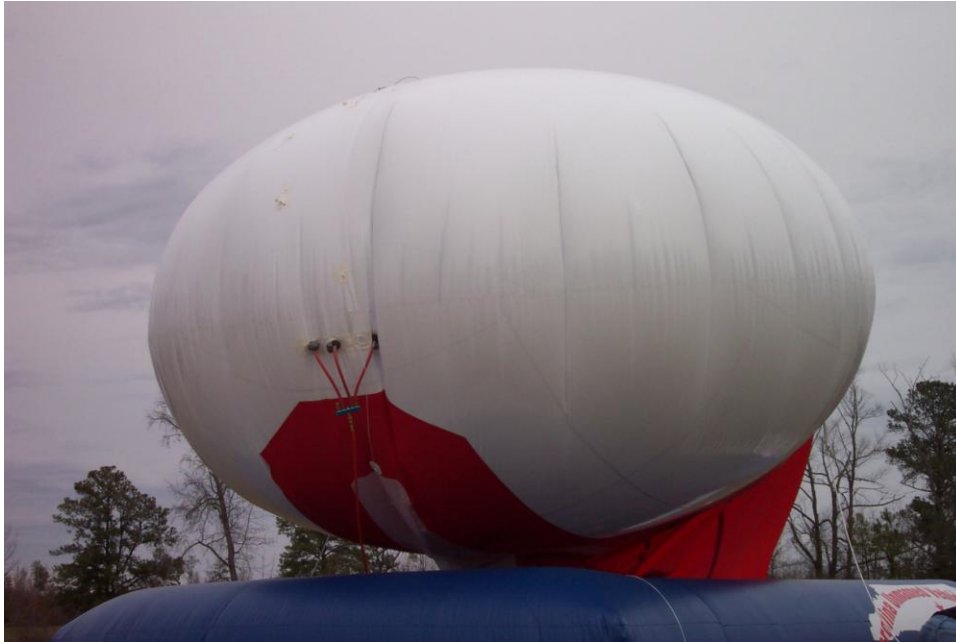
Front View during Inflation