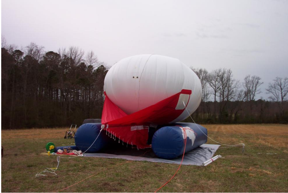
Rear View On Helirest