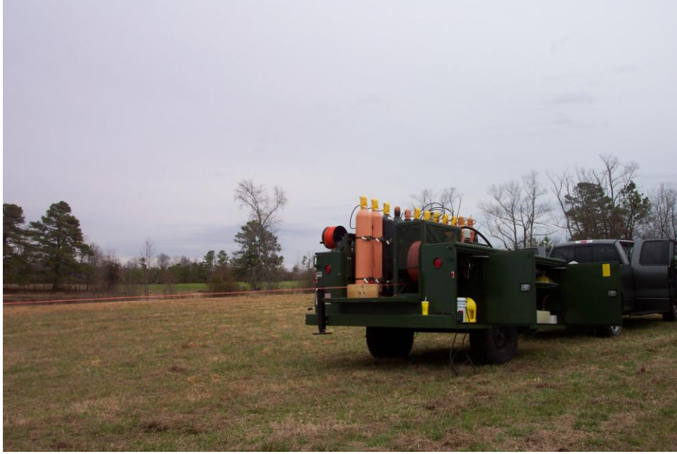
Prototype Carrier rear View