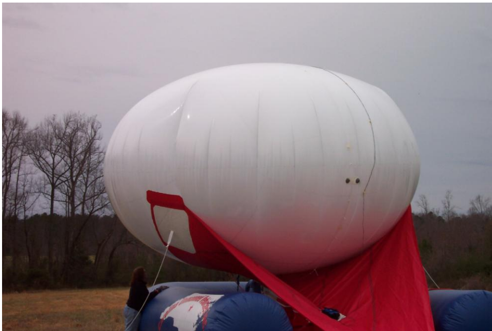
Rear View during Inflation